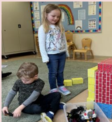
Pre K: Rainbow Connection

The 2-3 class is wrapping up Super Hero Academy , and our super heroes have been very engaged. They even wrote a thoughtful letter to the UUC board suggesting improvements such as adding a waterpark or an ice skating rink to the church. In January, our second and third graders will begin " Let's Learn with Bluey ," a UU values curriculum.