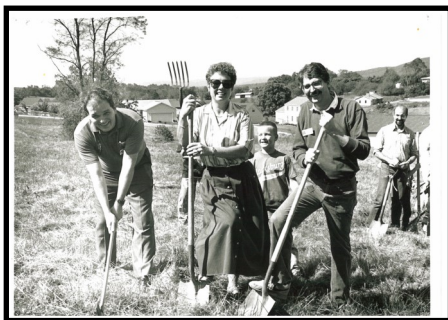
Breaking ground in 1991

Twenty-six years ago, a courageous group of folks moved into their new building, just up the hill from the house where their fellowship had been meeting for the preceding 25 years. They had a vision for the future of their religious community, and they committed their time, talent, and treasure to lay the groundwork for that future. Their vision was not only fulfilled but surpassed. So many people came that they had to offer two services each Sunday and still needed more space. Sixteen years later, they dedicated this expanded building—with staff offices, a larger kitchen, spaces dedicated for religious education, and a beautiful sanctuary with a view of the mountains.