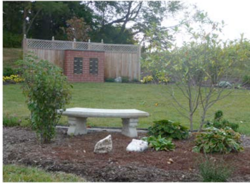
The garden offers a beautiful, restful spot for contemplation.