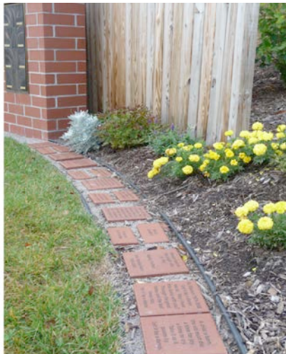
Large and small pavers surround the open lawn area.