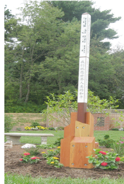
The Peace Pole at the garden entrance memorializes the 32 victims of the April, 16, 2007 massacre on the Virginia Tech campus. Peace is inscribed in the eight languages of their native countries.